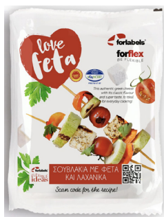
Forlabels S.A., Greece

Design elements feature strongly in this group and will be considered as equally important as the technical printing/ converting procedures.