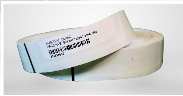
Germark S.A., Spain

This group is designed to recognise new industry applications/ products (in the opinion of the judges) not covered by other groups, including innovative use or applications of the label press. This group also includes labels which incorporate integrated electronic devices which are not included in Group A6 – Security.