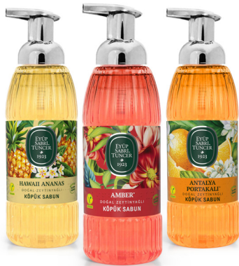
Çiftsan Label and Packaging Company, Turkey