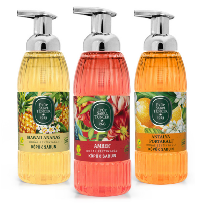
Çiftsan Label and Packaging Company, Turkey